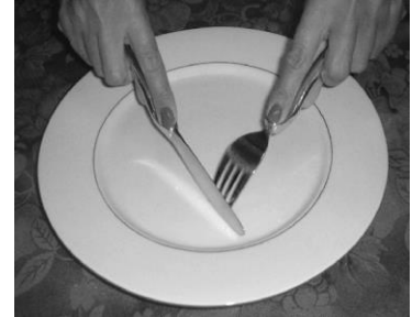
Table manners are the rules of etiquette used while eating, which also include the appropriate use of utensils. Here are some basic rules for taking into account during a formal meal: